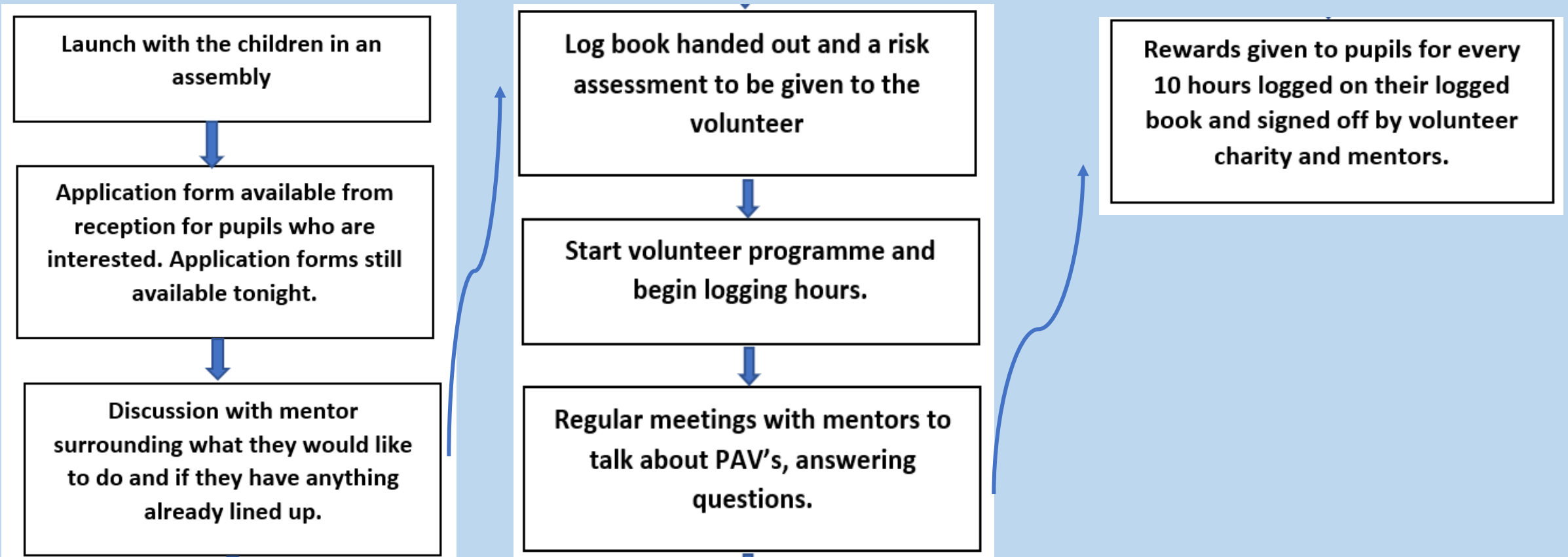
Flow chart outlining the PAV's process